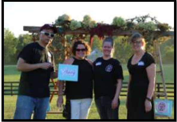
Page County High School students visit the White House and EMJ Farms