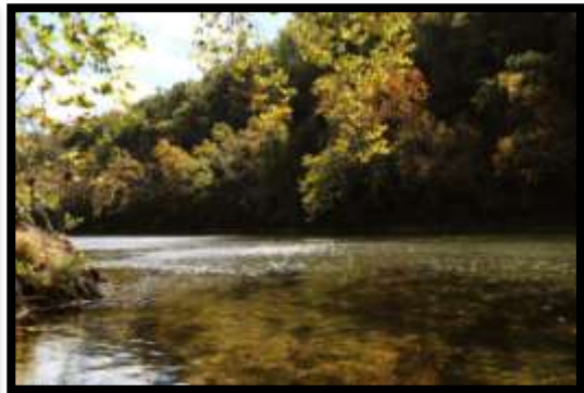
South Fork of the Shenandoah River