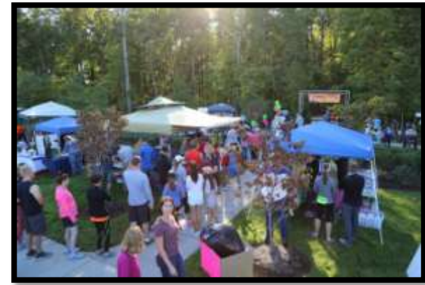
It is great seeing all the healthy, happy people utilizing the trails at Leopold's Preserve for the annual Haymarket Fall Fest Trail 5k and 1k Fun Run .